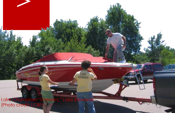
Lake Champlain Greeters, Lake Stewards